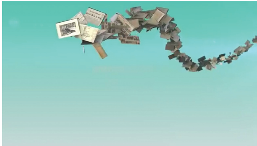
Instruction video for Delpher online database (in Dutch).

the Staatsbibliothek in Berlin (free), Gallica of Bibliothèque Nationale de France (free) and the Trove collection of National Library of Australia (free).