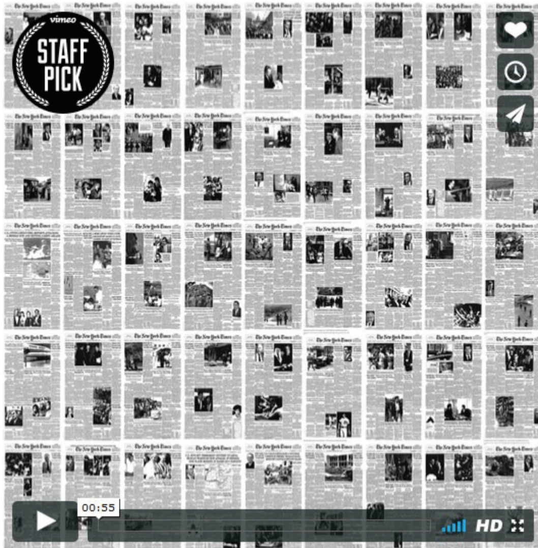
Josh Begley, Every NYT front page since 1852. Example of a ‘shock and awe’ animation based on digitised newspaper material.

animations. Are these kind of results of more importance than other output? Visualisation is of course tempting, because it gives us a (sometimes animated) image of patterns in history, and for some people visual material (often called ‘evidence’) is more powerful than evidence in words, which is often called ‘argumentative’. 13